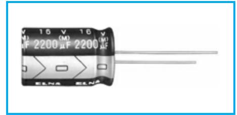
Marking color : White print on a black sleeve