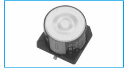
Marking color : White print on an brown sleeve